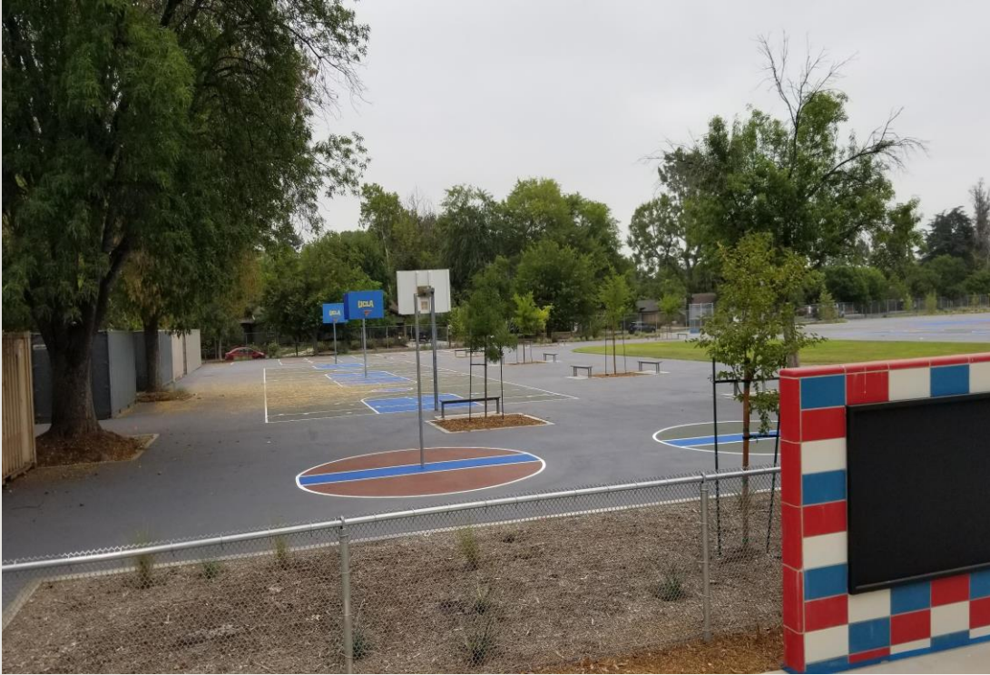
Woodlake Elementary School Paving Project