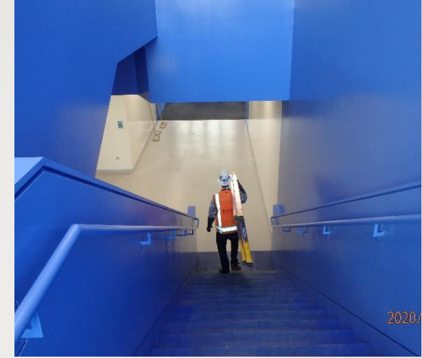
One-way path of travel