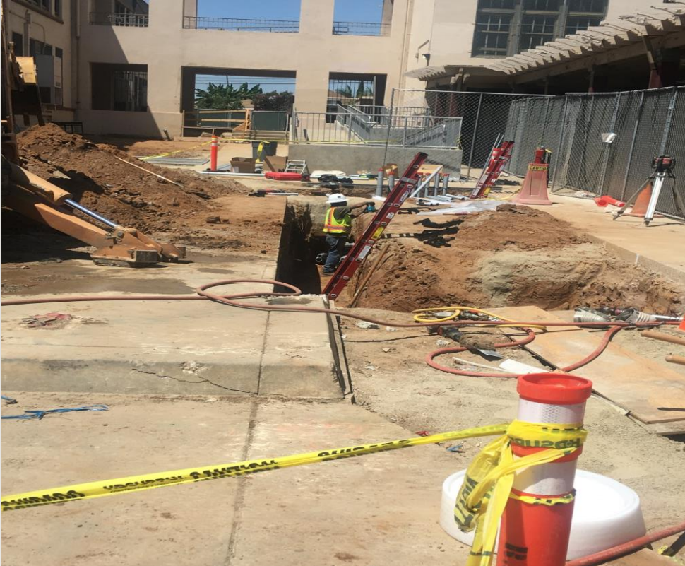
Belvedere Middle School Comprehensive Modernization Project