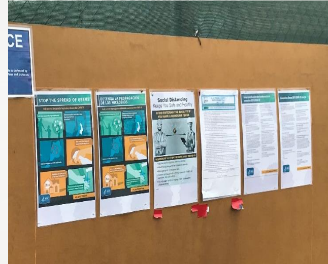
Signs posted in highly visible areas encouraging hygiene.