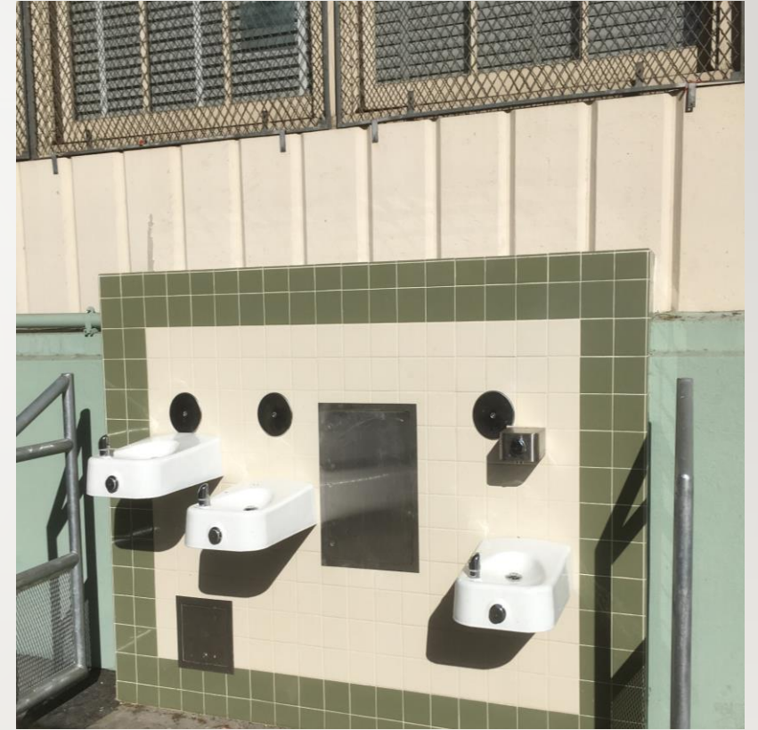
Albion Elementary School