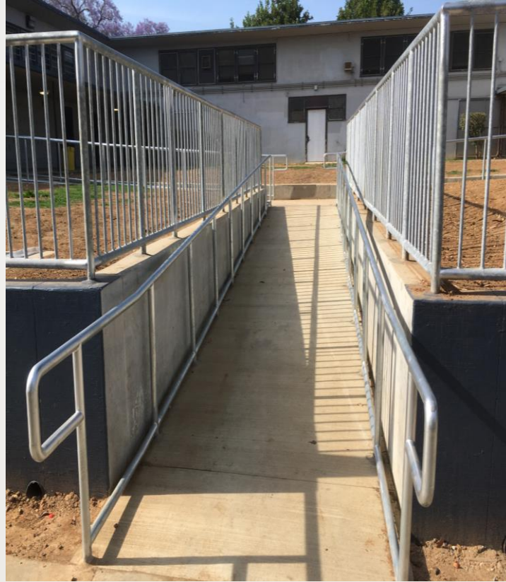
Griffith Middle School