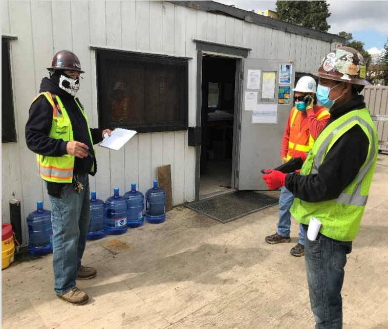
Daily Screening and Face Coverings