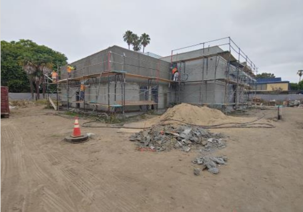
Drew Middle School Clinic