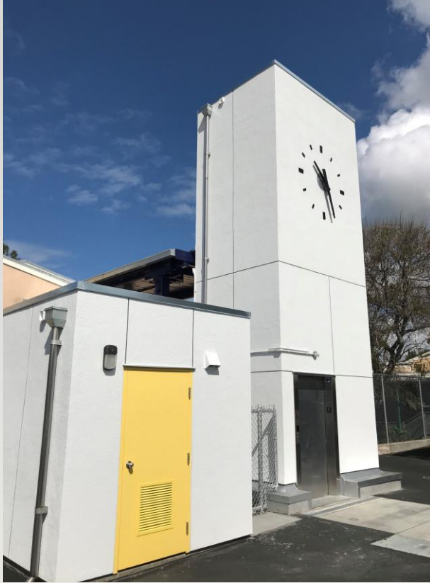
Sunland Elementary School