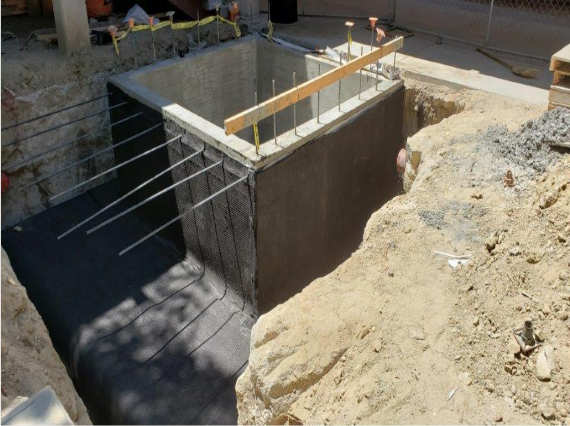
Frost Middle School New Elevators Project