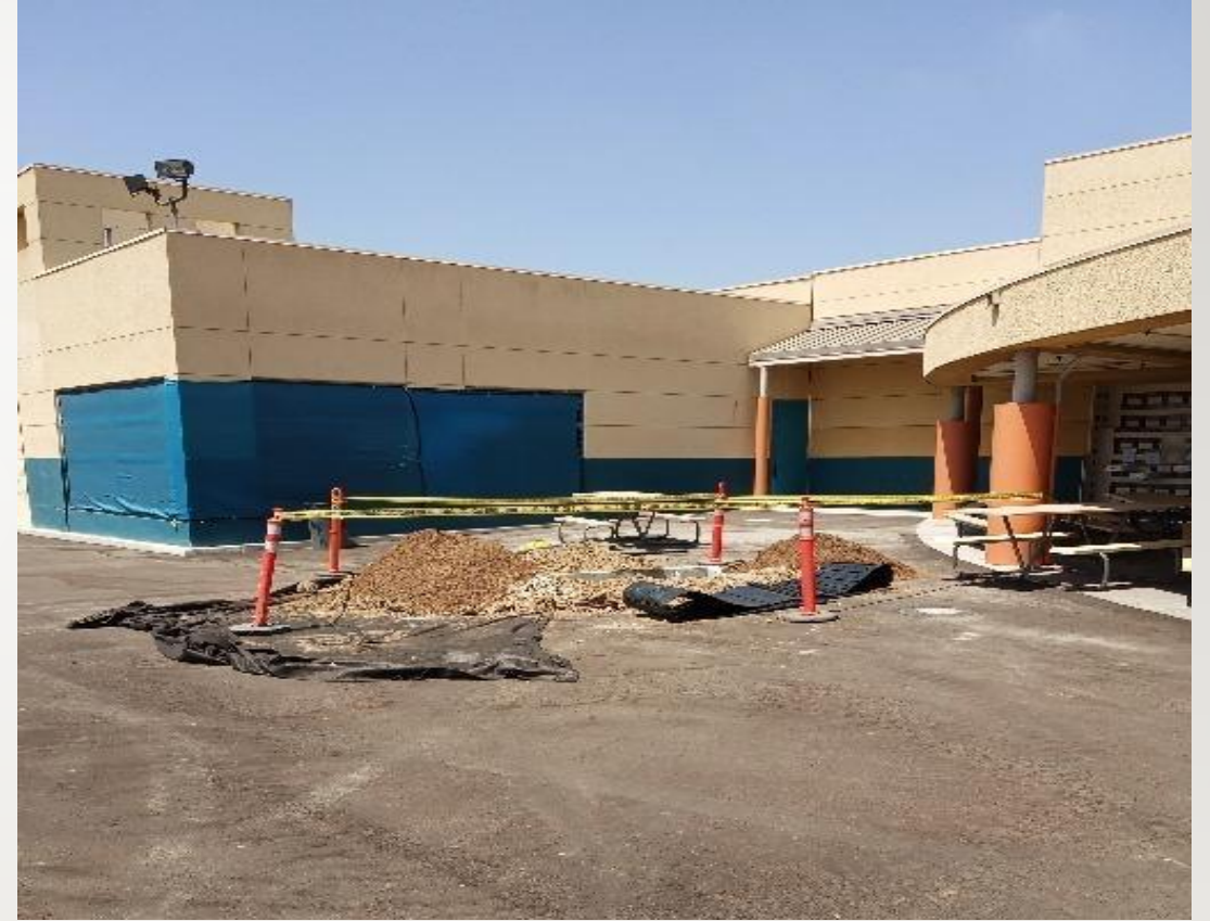
Gratts Learning Academy for Young Scholars Elementary School Playground Replacement Project