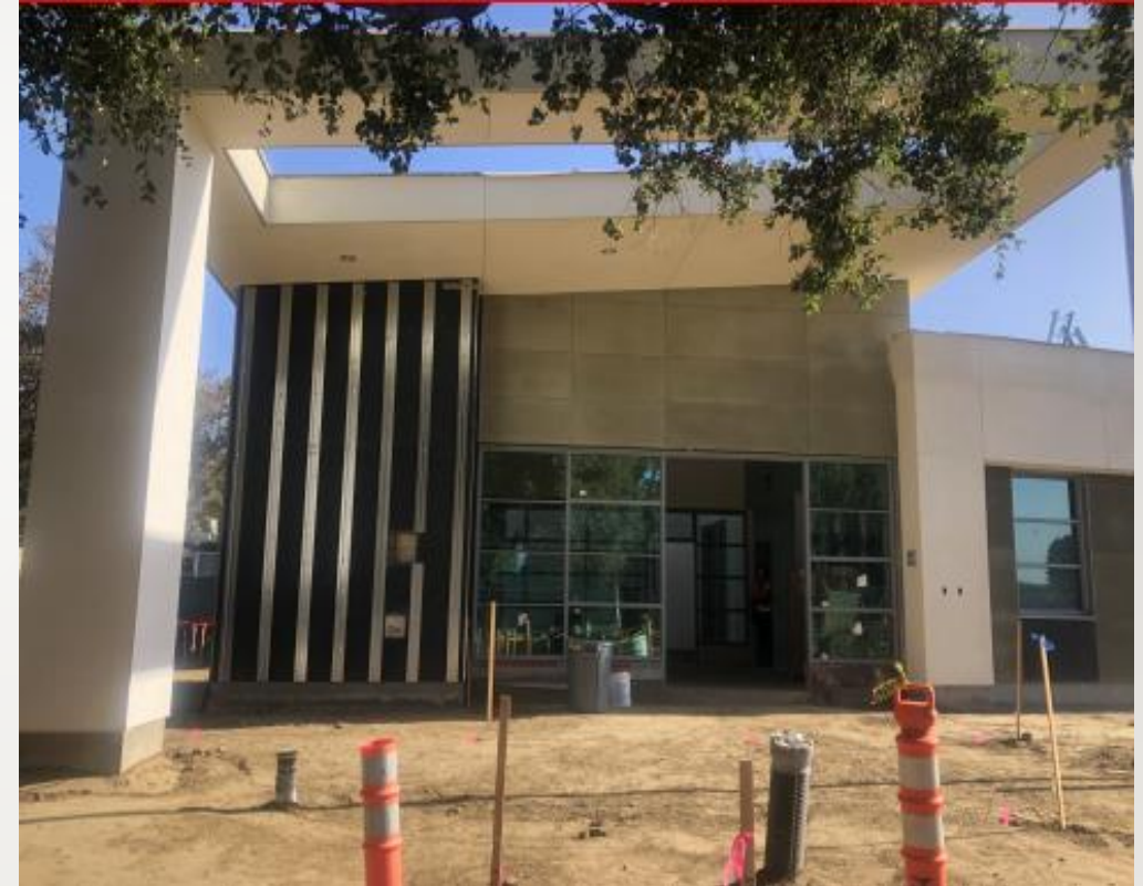
Balboa Mental Health Center – Clinic Expansion