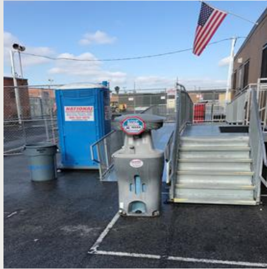
Porta Potties and Hand Washing Stations