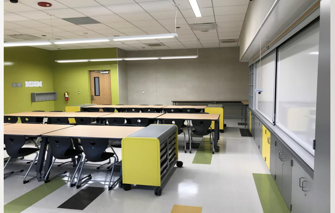
Colfax Elementary School Classroom Addition