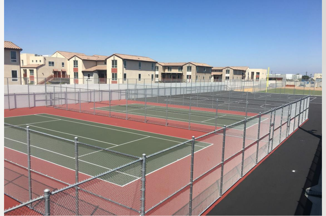
Jordan High School Playfield Project