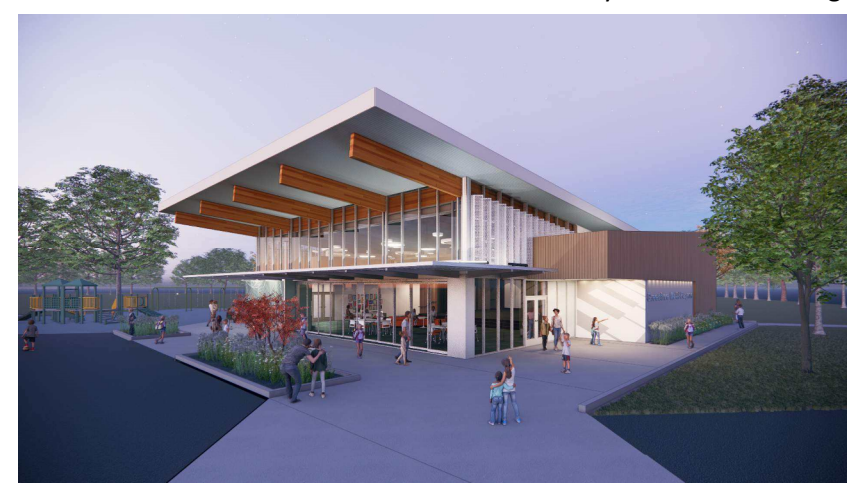
Greentree Elementary New MPR Building