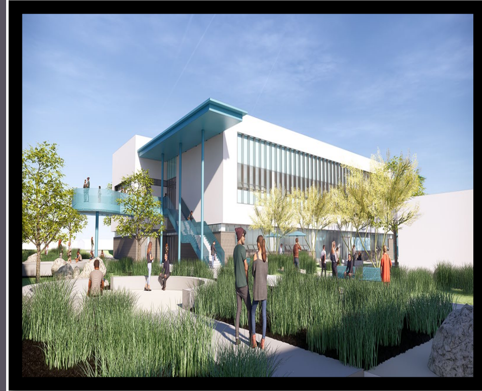
Villa Park High School