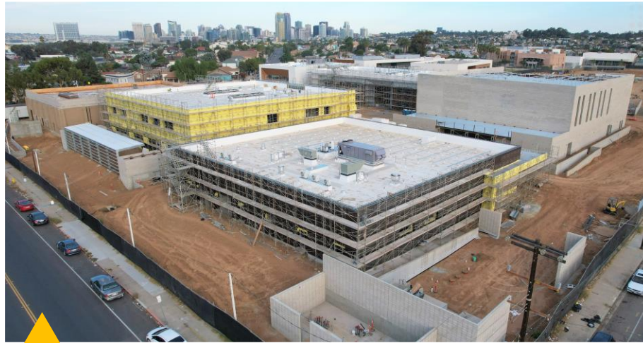
Logan Memorial Educational Campus