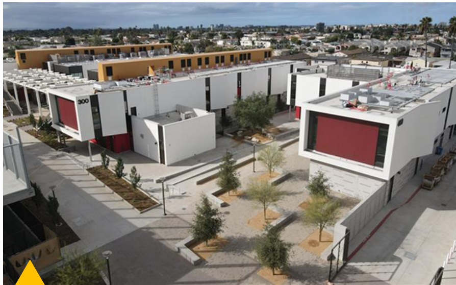
New Wilson Middle School Campus