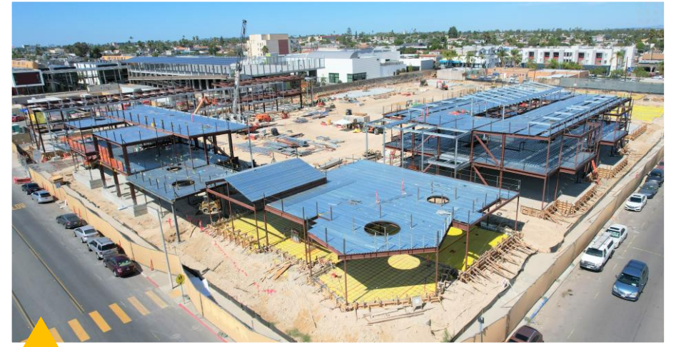
Central Elementary School - New Campus