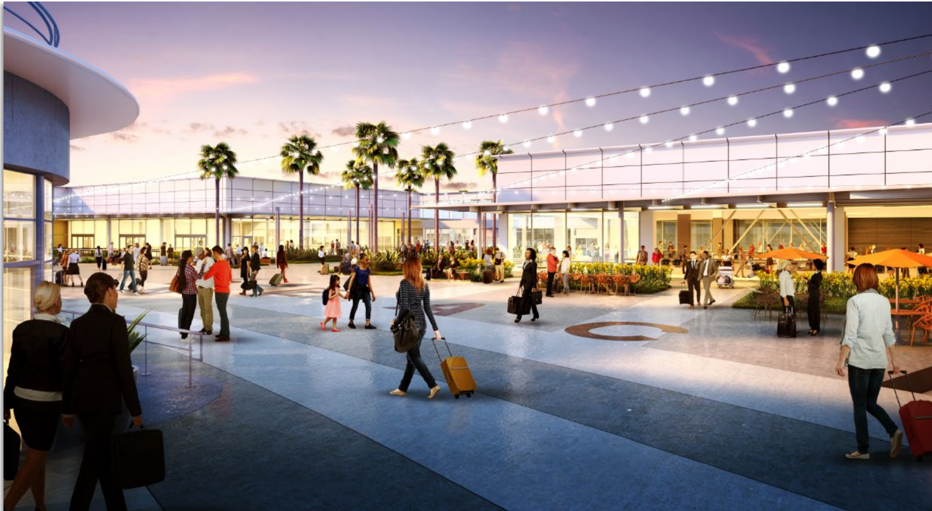
New Meet & Greet Plaza