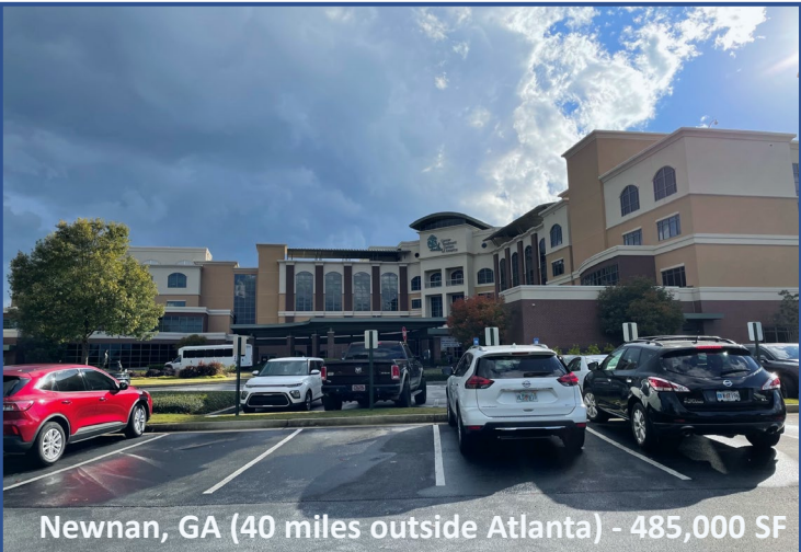
Newnan, GA (40 miles outside Atlanta) - 485,000 SF