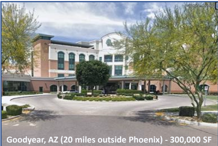
Goodyear, AZ (20 miles outside Phoenix) - 300,000 SF