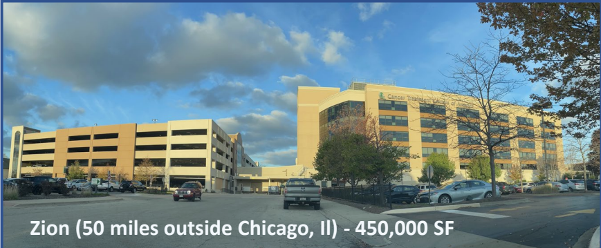
Zion (50 miles outside Chicago, IL) - 450,000 SF