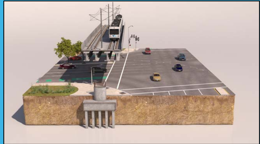
At Tully Road