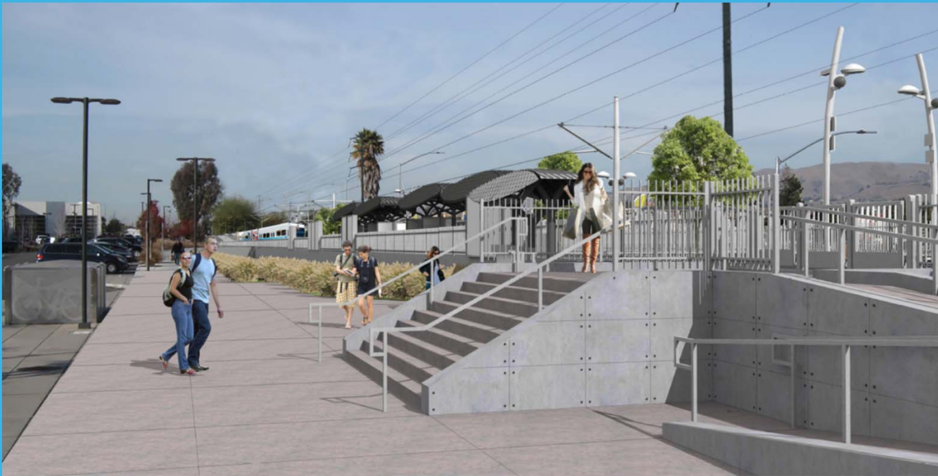
EASTRIDGE STATION LOOKING NORTH