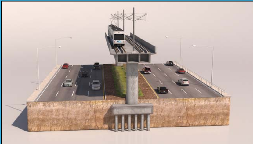
Median of Capitol Expressway