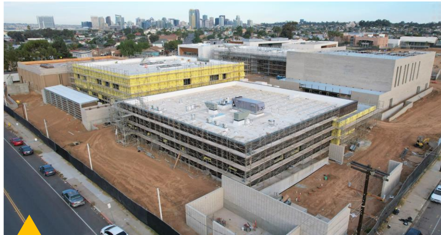
Logan Memorial Educational Campus