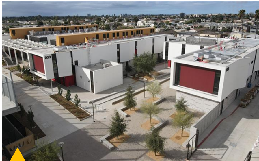
New Wilson Middle School Campus