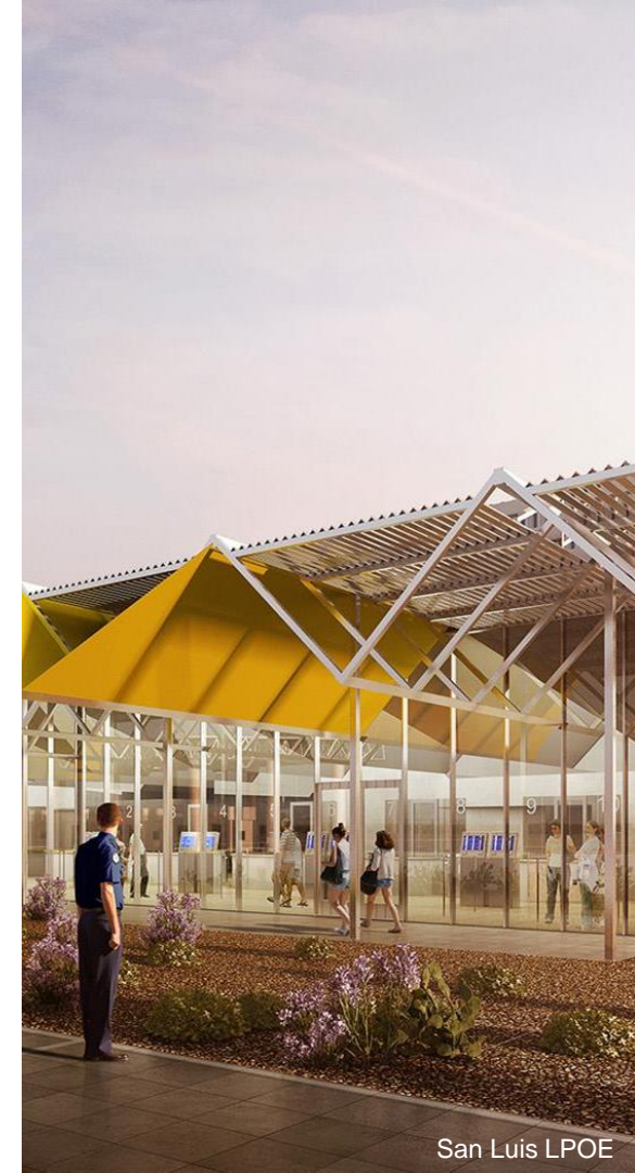
San Luis LPOE