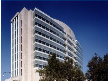
Federal Office Buildings