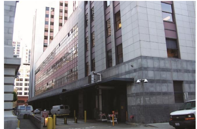
Curtain Wall at Appraisers Building on Sansome Street