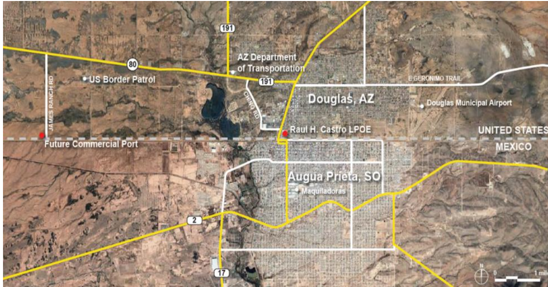
Future Site of new Douglas Commercial Land Port of Entry

1st St & Pan American Avenue, Douglas, AZ 85607