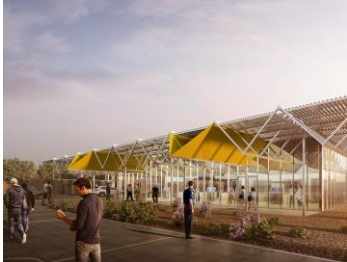
Land Ports of Entry