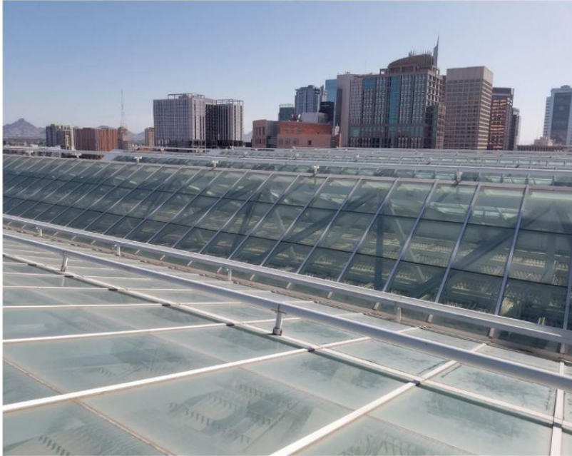
Sandra Day O'Connor Courthouse Skylight