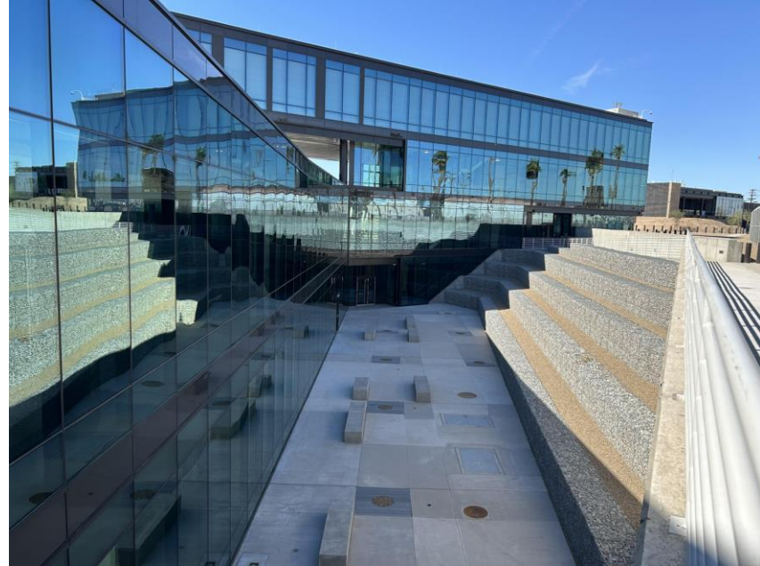
New administration building completed as part of Calexico 2A Construction