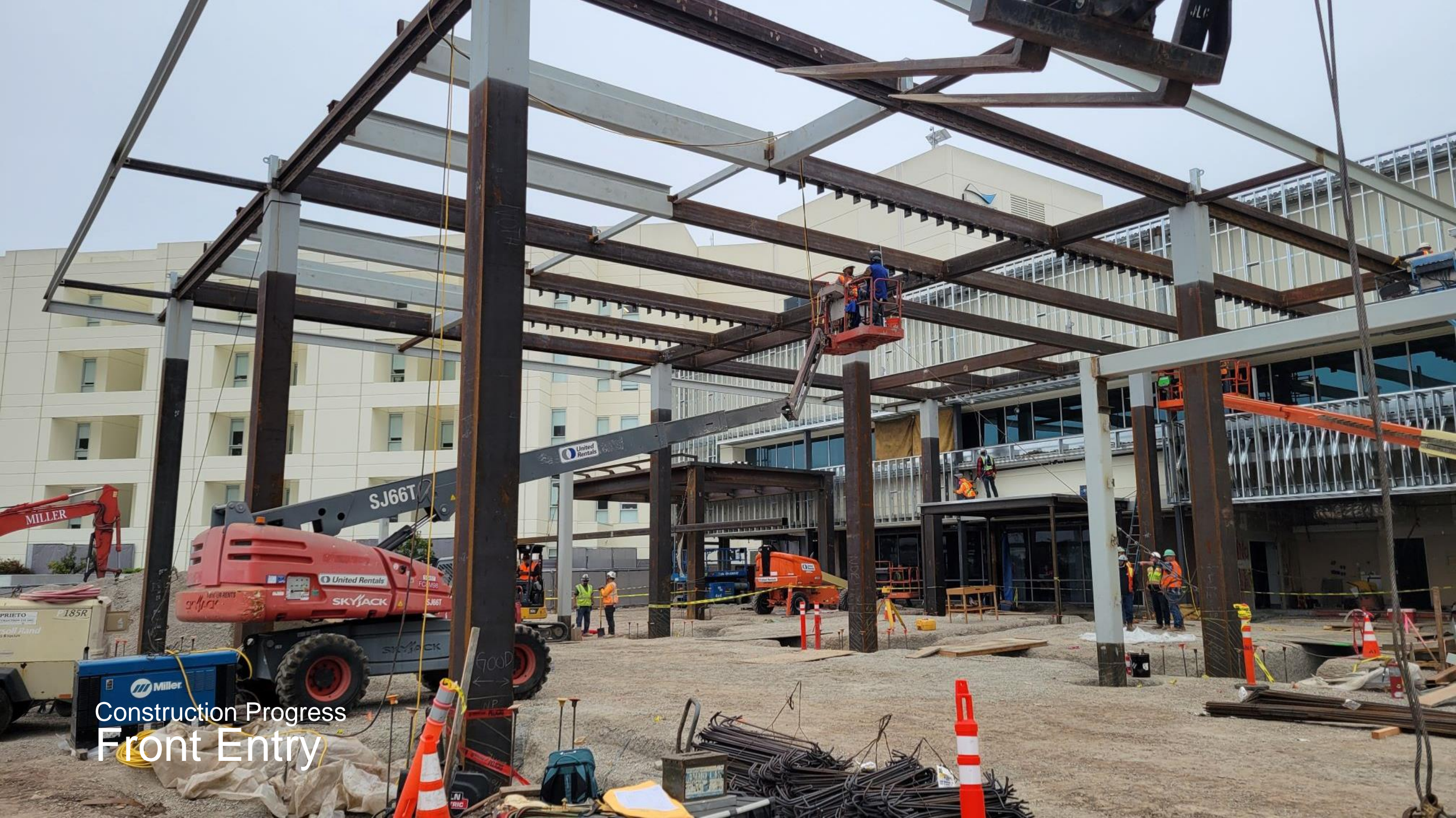
Construction Progress Front Entry