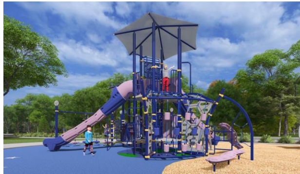
Sheridan Park Playground