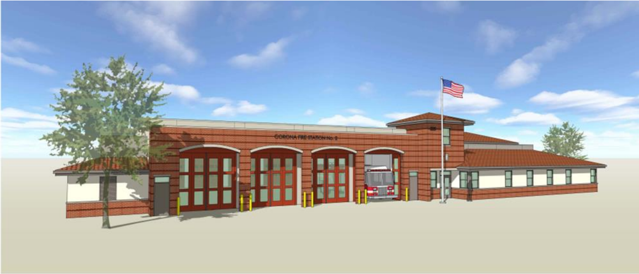
OPTION 3: SOUTHWEST VIEW