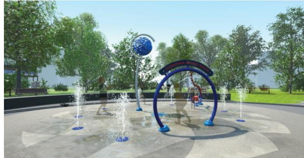
Victoria Splash Pad