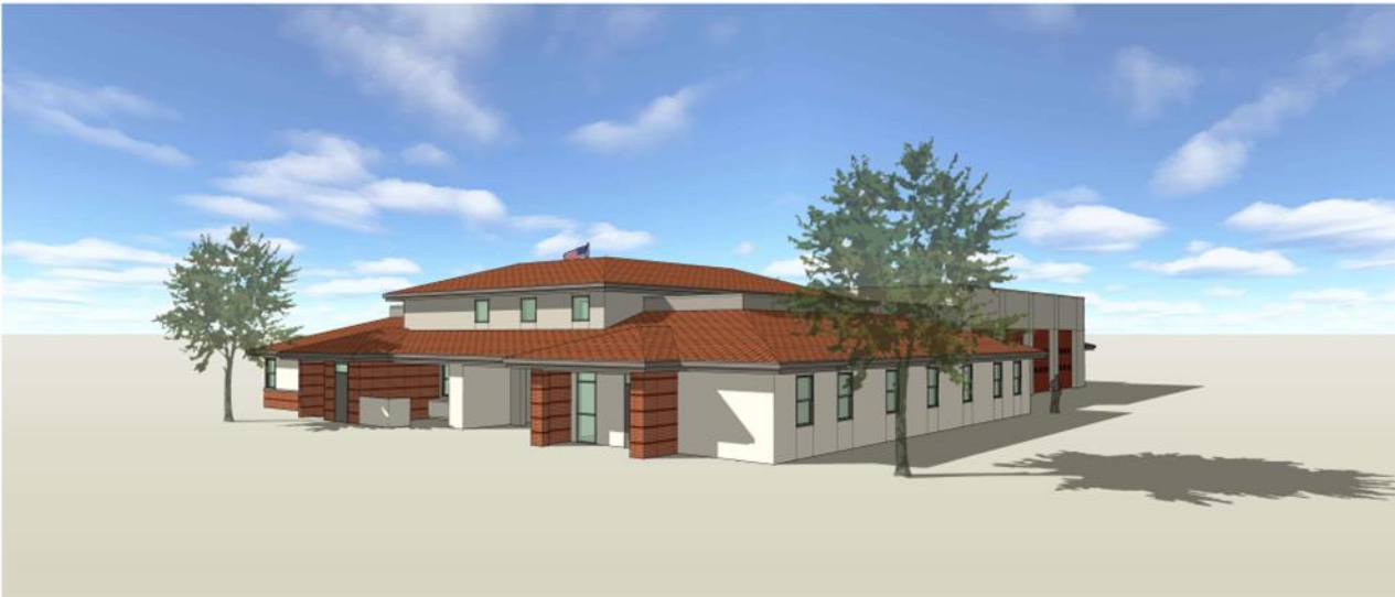
OPTION 3: NORTHEAST VIEW