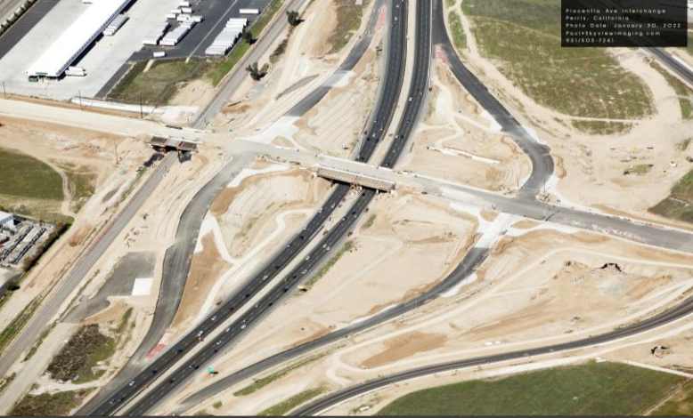
Photo: Aerial Interchange Perris, California Photo Date: January 30, 2022