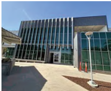
BUILDING GG, 2010's