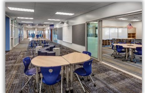
Loma Ridge Elementary School