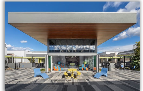
Solis Park School