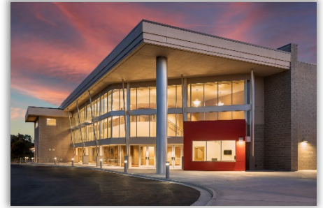
Woodbridge High School