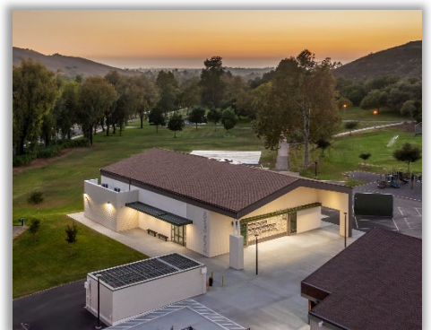
Bonita Canyon Elementary School