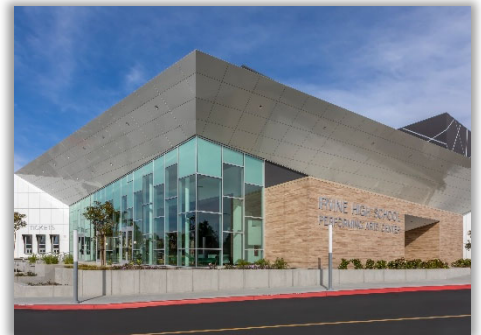
Irvine High School