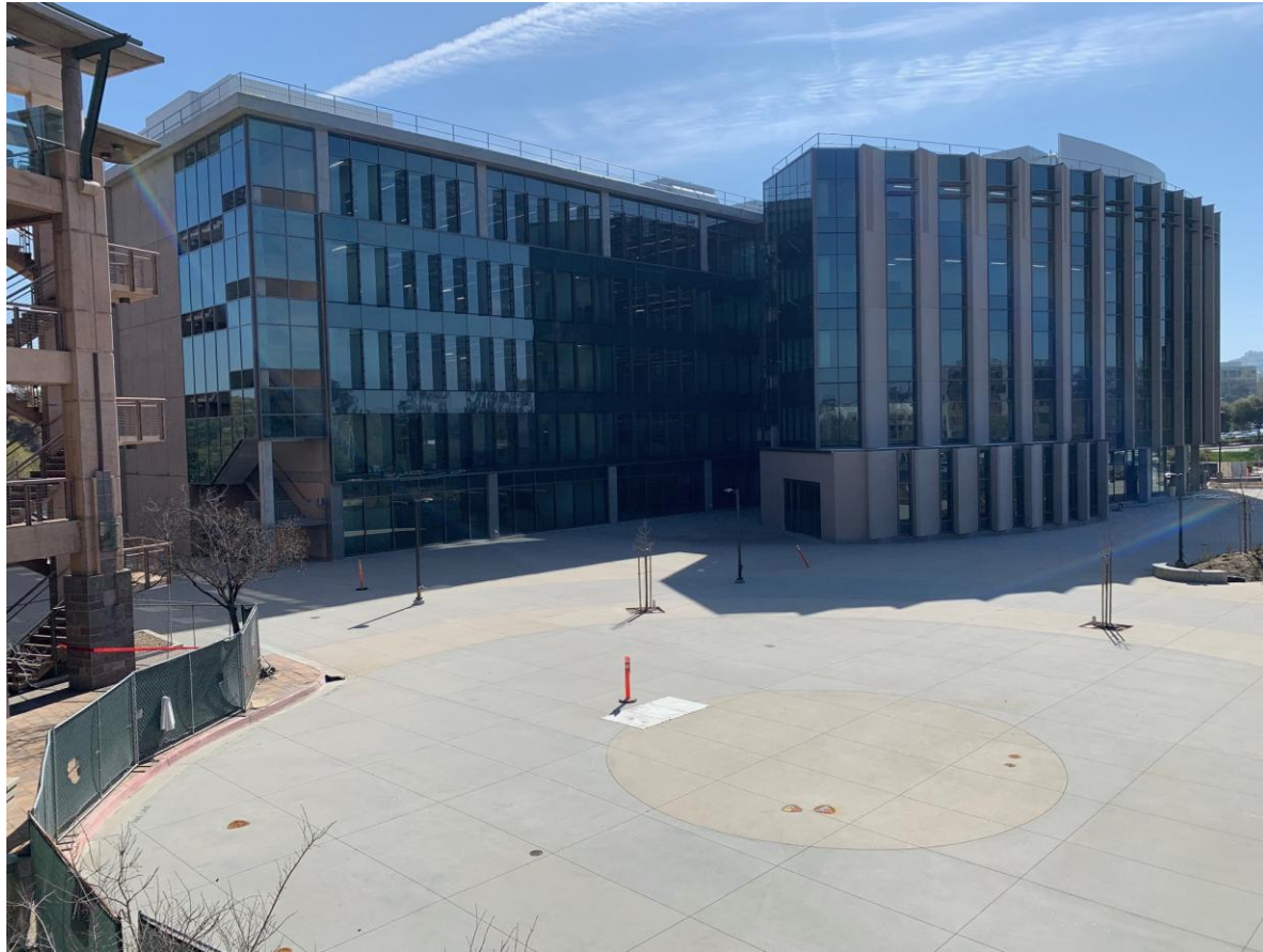
Falling Leaves Foundation Medical Innovation Building